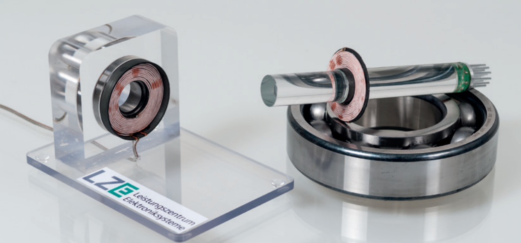
Wireless energy and data transfer through a ball bearing